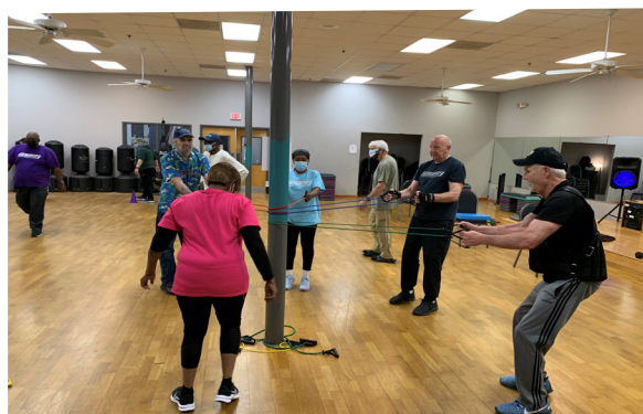
Veterans participate in an in-person Gerofit class.