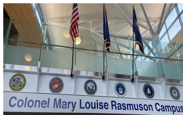
Entrance of the Colonel Mary Louise Ramuson Campus