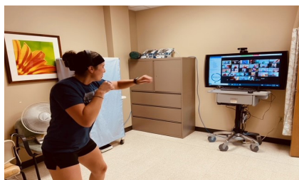
Instructor guides Veterans through an online Gerofit class

-Veteran in Murfreesboro, TN Gerofit Program