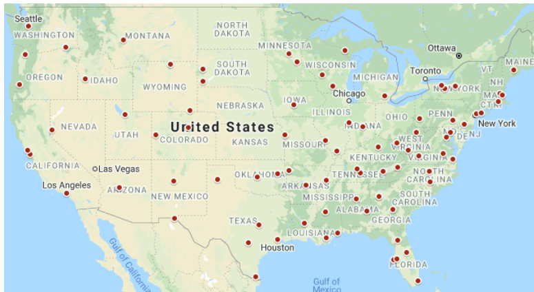
Each dot on this map represents a city where a VRHRC-SLC Principal Investigator is located.