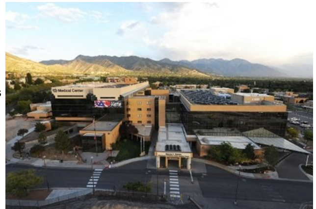
George E. Wahlen VA Medical Center

With a satellite office in Denver, CO, the Salt Lake City VRHRC maintains a diverse project portfolio with a specific emphasis on Native American/American Indian/Pacific Islanders, older adults, and caregivers of Veterans, often with a focus on outreach and partnership with community organizations. Recent projects address several rural needs such as: