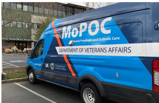
A MoPOC vehicle being used to provide services at a rural CBOC in Washington State

This was particularly poignant for those Veterans living in rural communities far from U.S. Department of Veterans Affairs (VA) medical centers. Having observed first-hand how this impacts health and quality of life, in 2019, with support from the VHA Innovator's Network, we started a pilot program aimed at breaking down barriers to orthotic and prosthetic (O&P) care access. Data from the two-year pilot demonstrated the effectiveness of our approach and prompted outspoken support from stakeholders within and outside of VA.