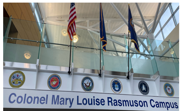
Entrance of the Colonel Mary Louise Ramuson Campus