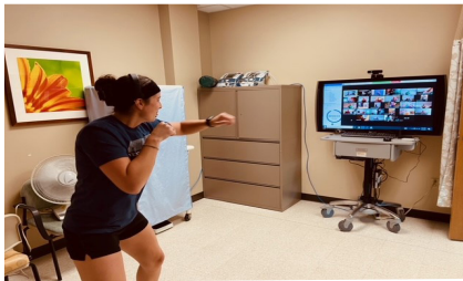
Instructor guides Veterans through an online Gerofit class

"The staff make the whole atmosphere fun. Gerofit is like a little club we have. People of all sizes and shapes go to class and they turn into your friends." -Veteran in Murfreesboro, TN Gerofit Program